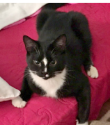
Peanut had a badly injured back leg when he was rescued by a SCBI trapper. Rather than amputating the leg, our vets started the process of wrapping and treating the leg daily. Three months later his leg was healed. A family who followed his story on our website fell in love and adopted him.