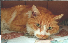
Chester and Jupiter are two deserving sweet 8 year old FIV+ kitties. They were rescued from an outdoor feral cat colony. They found their forever homes with two different families who understand and accept that FIV+ cats can lead long, healthy lives.