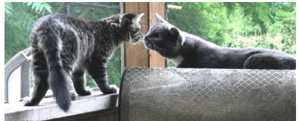
Backyard strays Bella and Mia – momma and daughter -- were rescued and adopted together to a wonderful family. They have 11 year old twin girls to give them lots of love and attention.