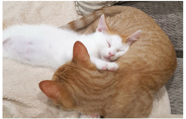
Trixie and Casey both came from an overcrowded shelter. They bonded in their foster home. Fortunately, a wonderful adopter fell in love with both of them so they could stay together.